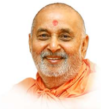
Inspirer: Pramukh Swami Maharaj